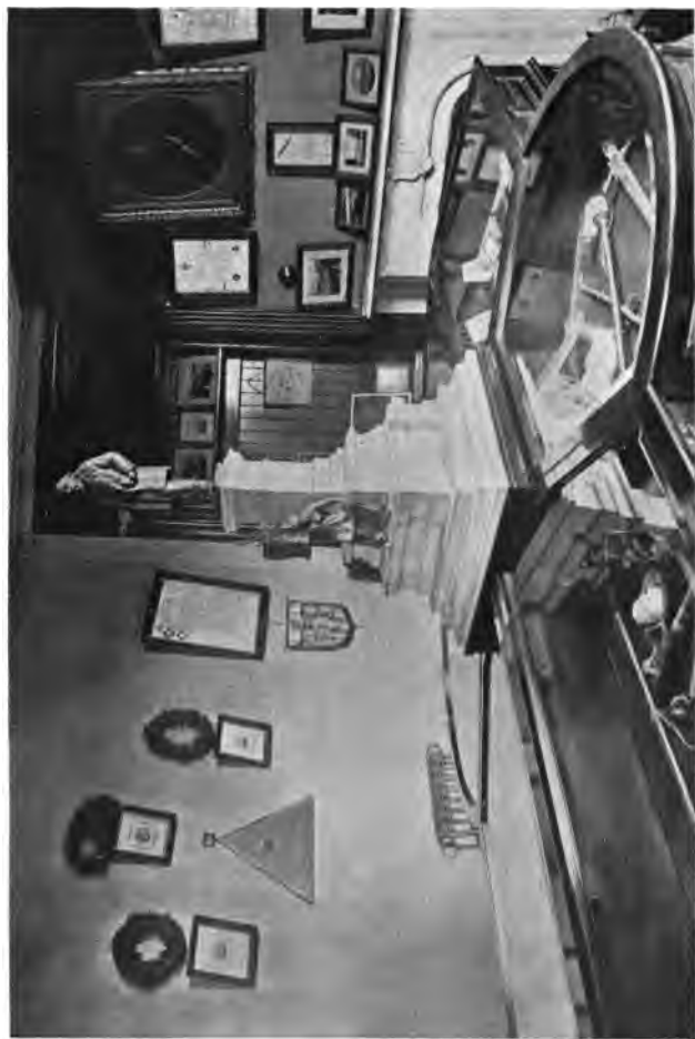
PIKE MEMORIAL ROOM IN THE HOUSE OF THE TEMPLE, WASHINGTON, D. C. WHERE ALBERT PIKE DIED.