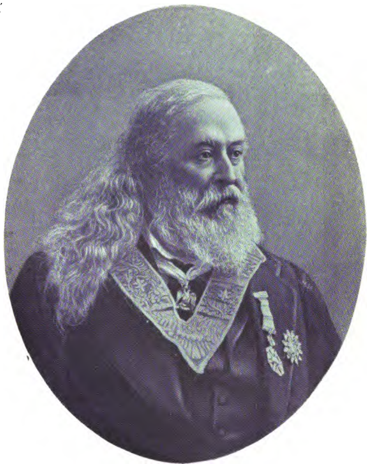
Albert Pike