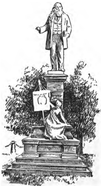
MONUMENT TO GEN. ALBERT PIKE Erected by the Scottish Rite Masons in Washington, D. C., in 1899.