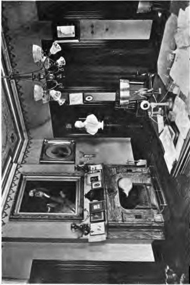
GRAND COMMANDER'S OFFICE, WASHINGTON, D. C., USED BY GENERAL PIKE.