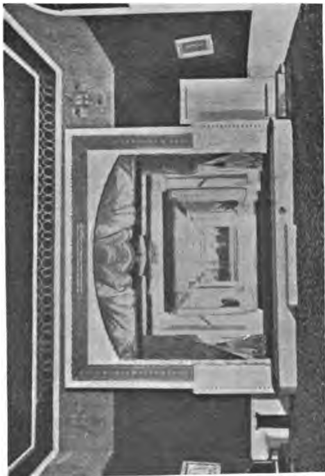
INTERIOR ALBERT PIKE CONSISTORY