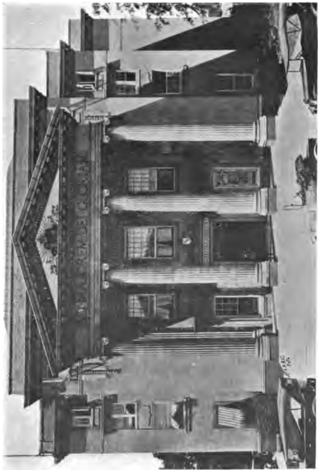
ALBERT PIKE CONSISTORY, LITTLE ROCK, ARK.