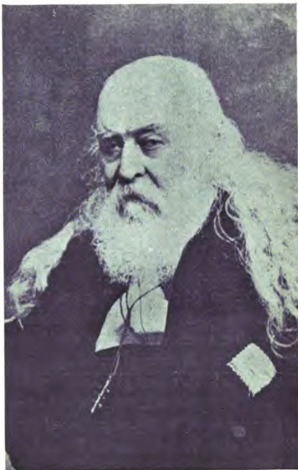
GENERAL ALBERT PIKE.