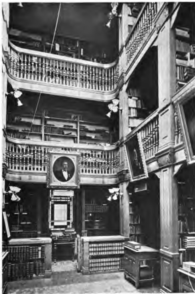
SECTION OF LIBRARY, SUPREME COUNCIL BUILDING, SCOTTISH RITE MASONS, USED BY GENERAL PIKE.