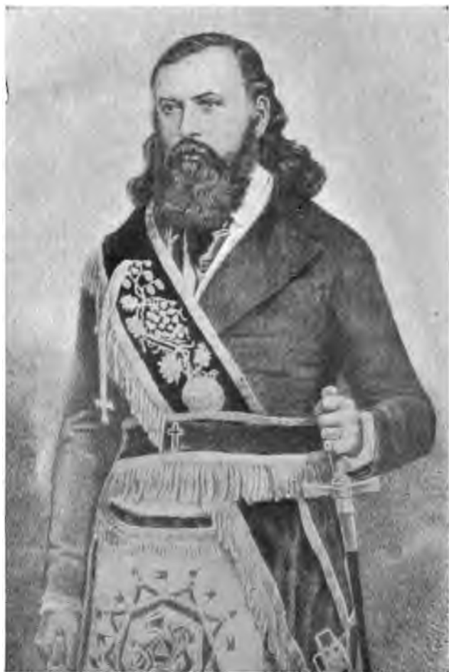
ALBERT PIKE AND HIS MASONIC REGALIA.